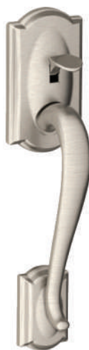
Camelot ● SNP