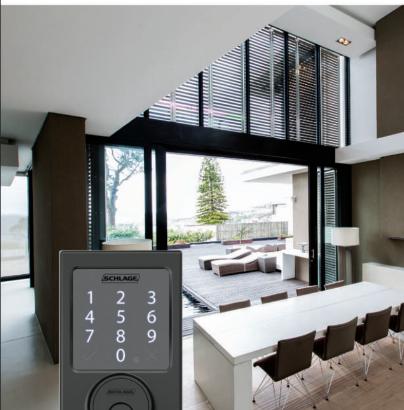
Century in Matte Black

Compatible with Apple HomeKit™ Technology, allows you to unlock your door by simply asking Siri on your iPhone®, iPad® or iPod touch®. That HomeKit™ compatibility also puts you in control of the rest of your home, giving you the power to set scenes for things like your lights, doors, and thermostats. Which means the Schlage Sense™ deadbolt doesn't just make your home smarter – it makes your whole life easier.