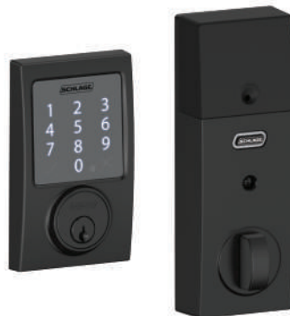
Century ● B