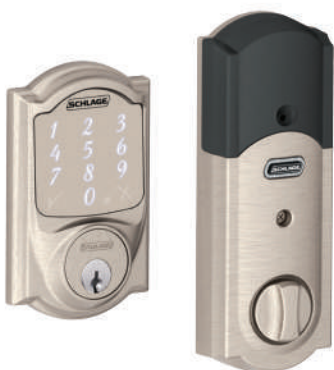
Camelot ● SNP