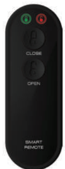
Optional RF Remote Key