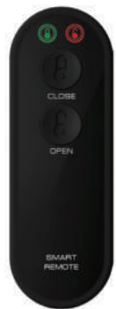
Optional RF Remote Key