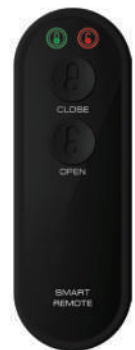
Optional RF Remote Key