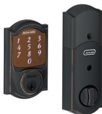
Camelot ● AB