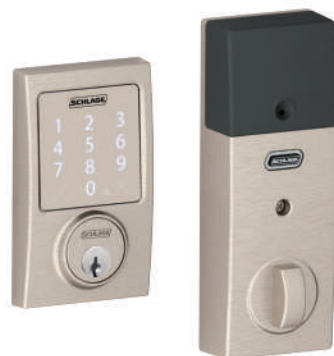
Century ● SNP